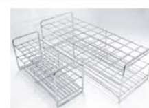
Test Tube Rack