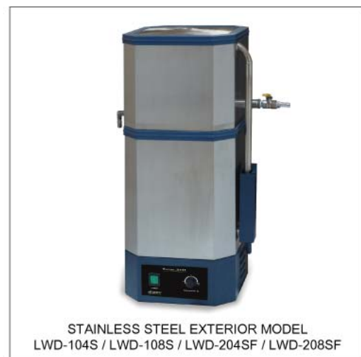
STAINLESS STEEL EXTERIOR MODEL LWD-104S / LWD-108S / LWD-204SF / LWD-208SF