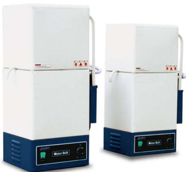
WD-2004F Basic Water Still /w Prefilter