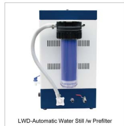
LWD-Automatic Water Still /w Prefilter