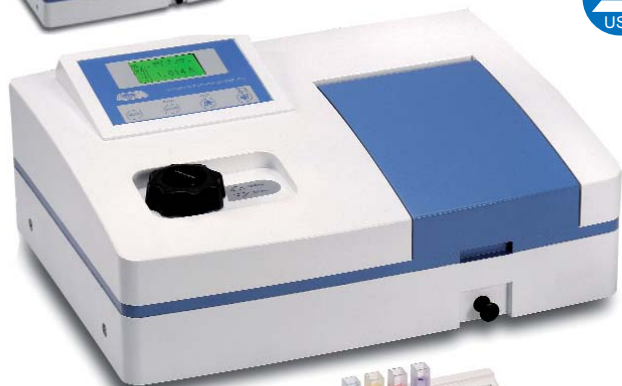
"V-1100" Part no. 4120025