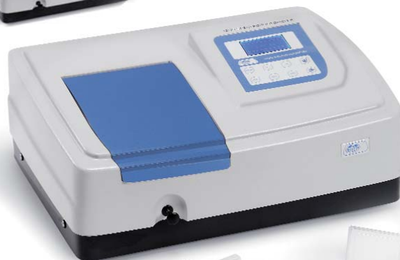
"VR-2000" Part no. 4120026